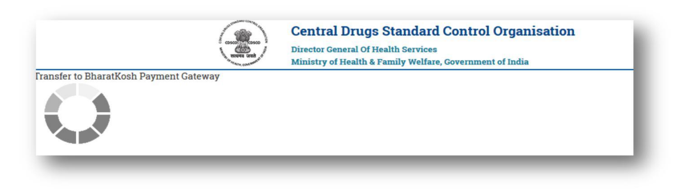
Figure 3.1 Initiation of online payment with Bharatkosh

On Click Submit button Payment request is forward to Bharat Kosh Payment gateway